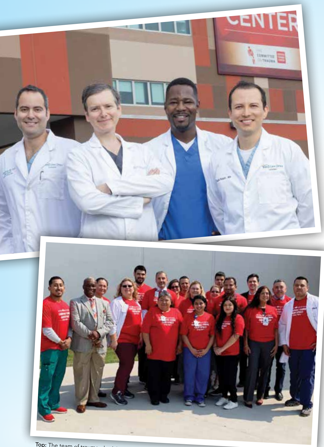
Top: The team of trauma physicians who provide critical care to those in need. Bottom: The staff of South Texas Health System Weslaco celebrates their recognition.